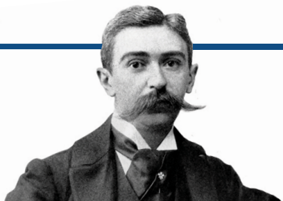
Baron Pierre de Coubertin

"The Modern Pentathlon event would test a man's moral qualities as much as his physical resources and skills, producing thereby the ideal, complete athlete."